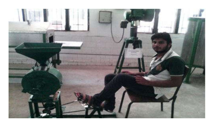
Figure 3. Pedal Operated Flour Machine

It enables person to drive devices at higher rates as compared to hand-cranking. Keeping this in mind a pedal operated flour mill was developed. The Machine consistof chain drive and belt drive that turnsand rotates stone wheels and wheat gets crushed to produce flour. The person can generate 4 times more power by pedaling than hand-cranking. The power level that can be produce by an average healthy athlete is 75 watt maximum. when the pedaling rate is up to 50-70 rpm continuously for an hour. Maximum power produce with legs is generally limited by adoptions within the oxygen transportation system, on the other hand the capacity of arm is dependent upon amount of muscle mass engaged that's why more power is developed by pedaling rather than hand-cranking.