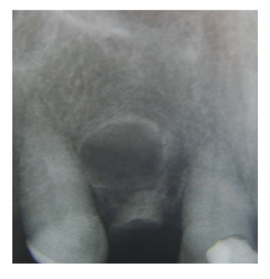
Fig. 1. Radiography