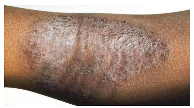
Figure 2. Showing Hyperpigmented Macules near Ulnar Process