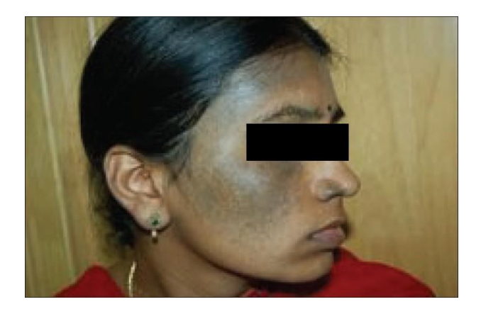
Figure 4. Showing Bluish Macules on Face.

Nylon brush dermatosis or nylon dermatosis was first reported from Japan (Sumitra S Yesudian, 1993) later as the aetiology and clinical features became more defined report came in from different parts of the world. Sumitra and yesudian (Sumitra S Yesudian, 1993) publish a study which probed the role of friction in causing amyloidosis cutis which to the best of our knowledge is the first report from India.